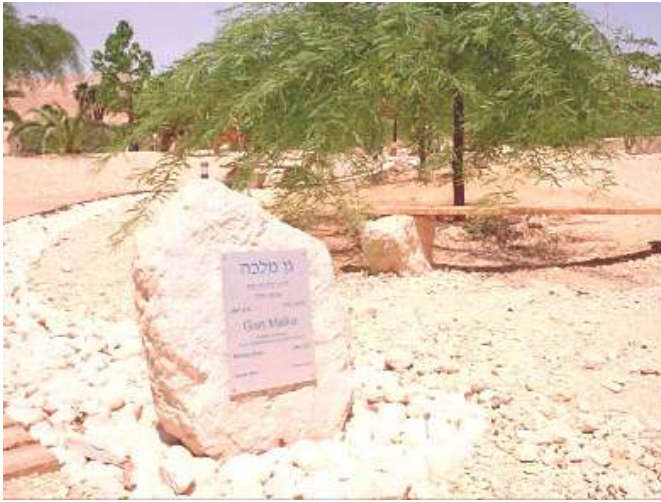
Entrance to Gan Malka